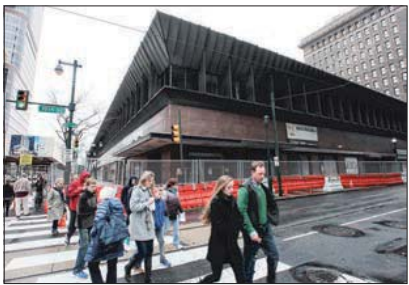
The corner of 12th and Market Streets as it is now, looking east-southeast.

East Market goes back to the future with a traditional downtown shopping district — done right.