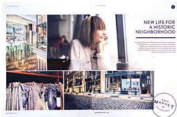
The East Market marketing prospectus, reminiscent of a J. Crew catalog, touts the revitalization of the historic neighborhood.