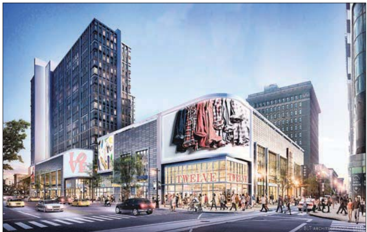
A rendering of 12th and Market Streets, looking east-southeast, shows the planned 17-story phase 1 apartment tower at left. Phase 2 plans are for a second 17-story apartment tower on top of the building in the foreground. BLT Architects