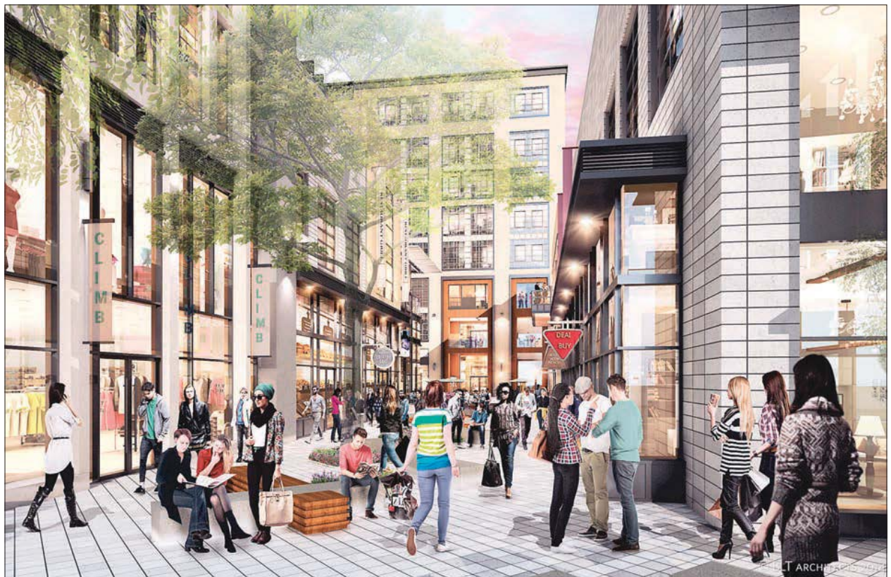
Chestnut Walk will be a new pedestrian passage at mid-block. The project will ultimately encompass the entire four-acre block, from Market to Chestnut, between 11th and 12th Sts.

✉ ingasaffron@gmail.com ☎ 215-854-2213 📍 @ingasaffron