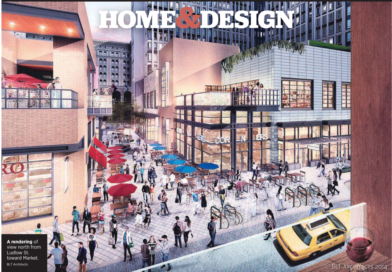
A rendering of view north from Ludlow St. toward Market. BLT Architects